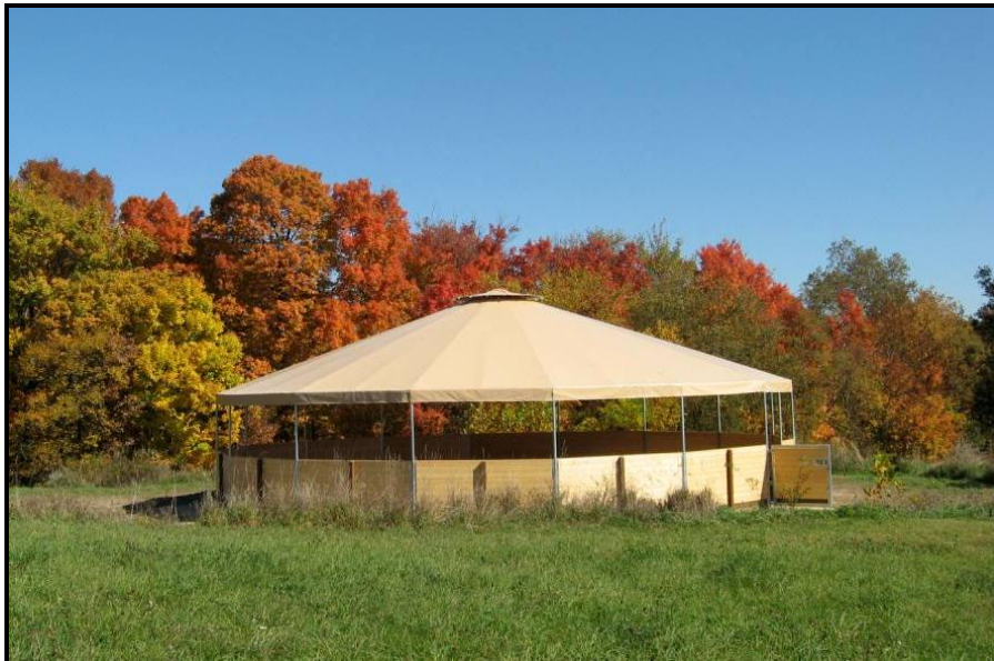
17. Congratulations!!! Your Round Pen is now ready to use.