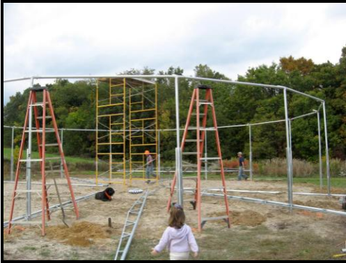
7. Connect ALL top pieces & setup scaffolding in center of Round Pen.