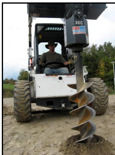
3. Drill holes 2.5 ft deep.