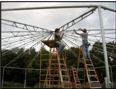
9. Continue connecting all trusses to center piece.