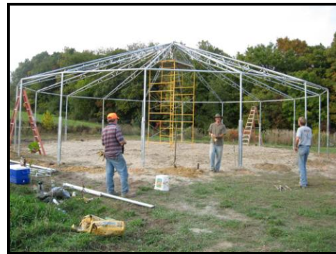
10. After connecting all trusses you can start installing the side walls.