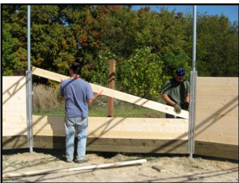
11. The side walls consist of T&G 2x6's