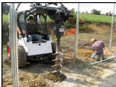
5. Embed uprights in concrete & level.