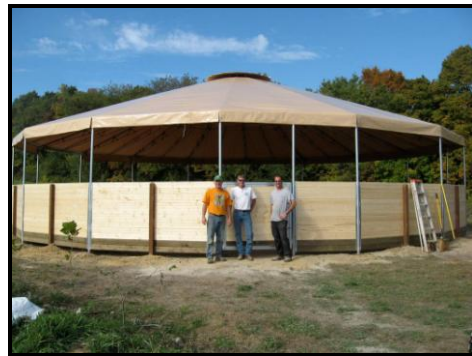
16. Double check everything.