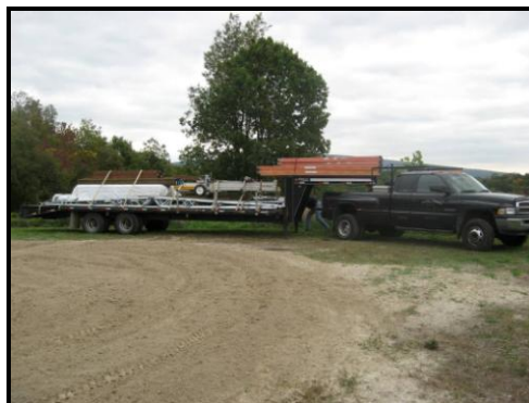
2. Your Round Pen Kit arrives!