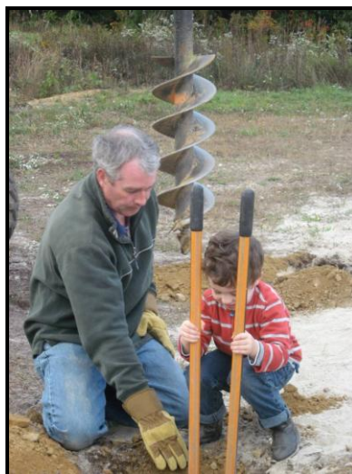
4. Remove loose debris & prep. for concrete.