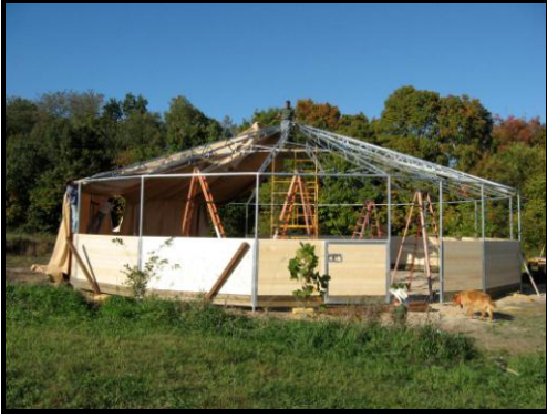
13. Pull vinyl cover from one side.