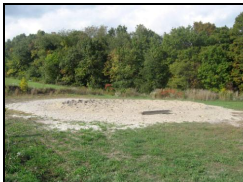
1. Clear & Grade jobsite