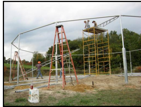
8. Use scaffolding to connect uprights to circular center piece.