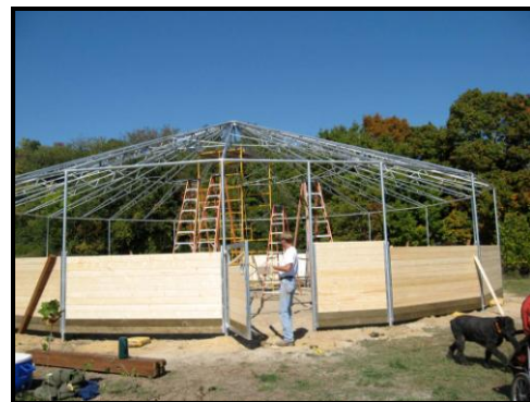
12. Install Gates & then you are ready for the cover.