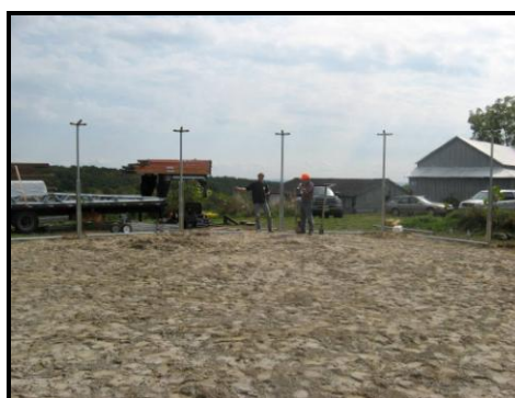
6. Once ALL uprights are embedded in concrete let cure for 24 hrs.