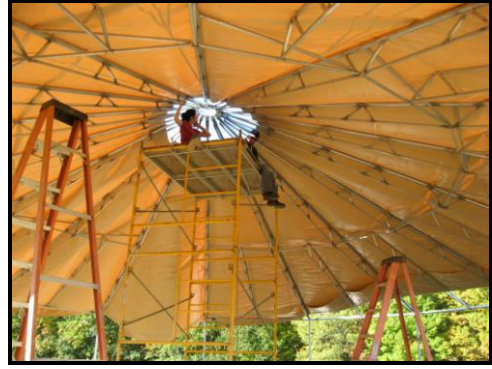
14. Center Vinyl Cover.